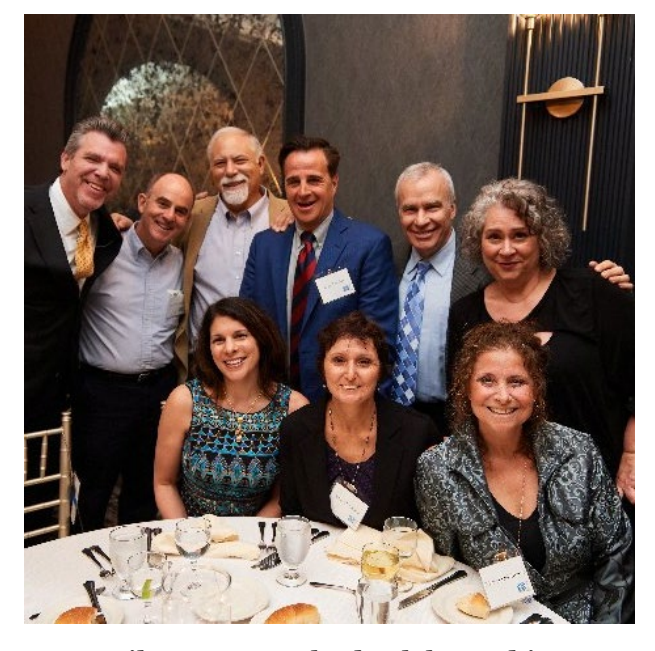
On April 22, WSOU had celebrated its 75th Anniversary and Hall of Fame Ceremony . WSOU alumni had a chance