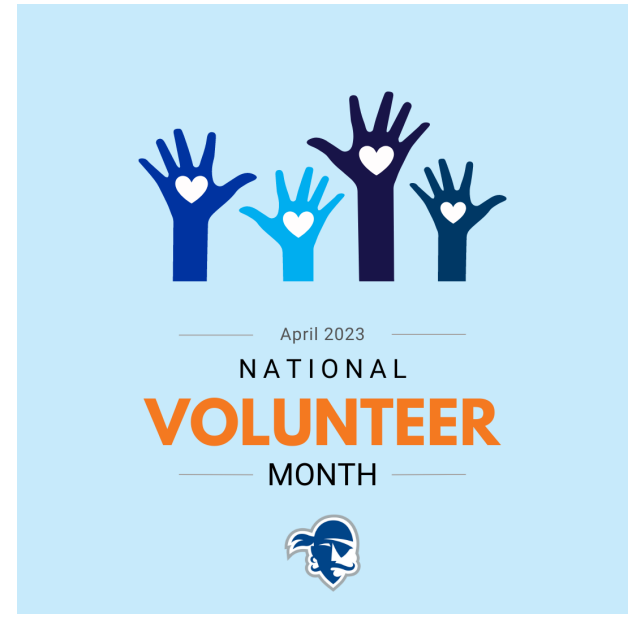
During the month of April, we highlighted just a few of our loyal volunteers, acknowledging all that they do to support