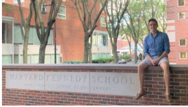
Diplomacy Alumnus Pursues Goal of Public Service