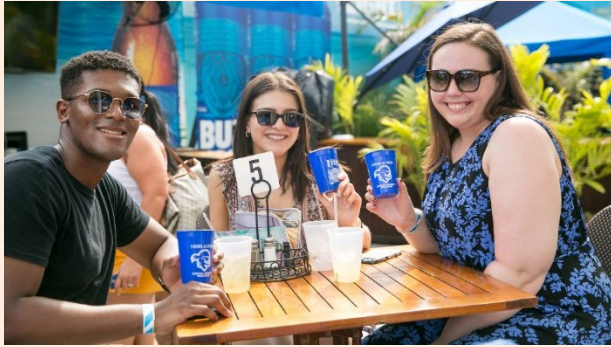
Young Alumni Club